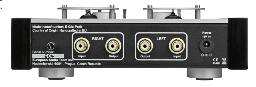
A simple rear panel carrying solid gold plated phono socket inputs and outputs. The unit is 'Handcrafted in EU, Czech Republic'.

The top mounted switches and control knobs demand positioning in the open, beside a turntable – making for a combo wider than most racks.