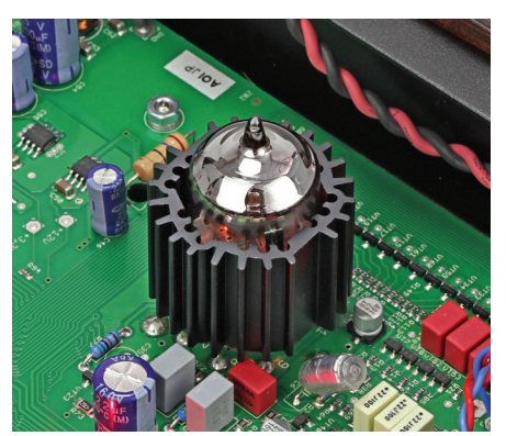
Clip on heatsinks help cool the valves, but they only run warm in any case.

In sound the Petit exceeded my expectations. It has all the sonic insight of a very good solid-state design, but enough of the atmosphere and low end weight that valves enjoy. Making Alison Goldfrap sound wonderfully breathy centre stage, every little intonation obvious, whilst the powerful synth lines had both weight and speed. Yes, speed: this little unit is not laconic or laid back,