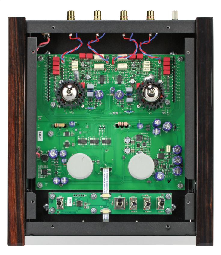
Neat circuit boards carrying soldered-on switches, rotary and lever style – hence top panel controls. The valves with finned heatsinks are at top.