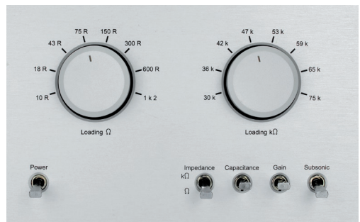
Top panel controls. At left is a rotary MC ( \Omega ) load switch and at right an MM ( k\Omega ) load switch. Lever switches below select MM capacitance, gain and Subsonic filter.

With the very latest and greatest new recordings like Big Band Spectacular, with The Syd Lawrence Orchestra, I had a vividly lit orchestra before me, with fast drumming and blaring saxophones put up in full scale. Knockout spectacular!